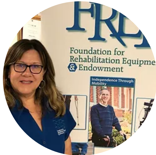
F.R.E.E.'s "given me a life again." -actual client

F.R.E.E. of Lynchburg works closely with health care professionals from Centra Health System, through collaborations with Virginia Baptist Hospital, Lynchburg General, Centra Home Health, and Guggenheimer Health and Rehabilitation Center.